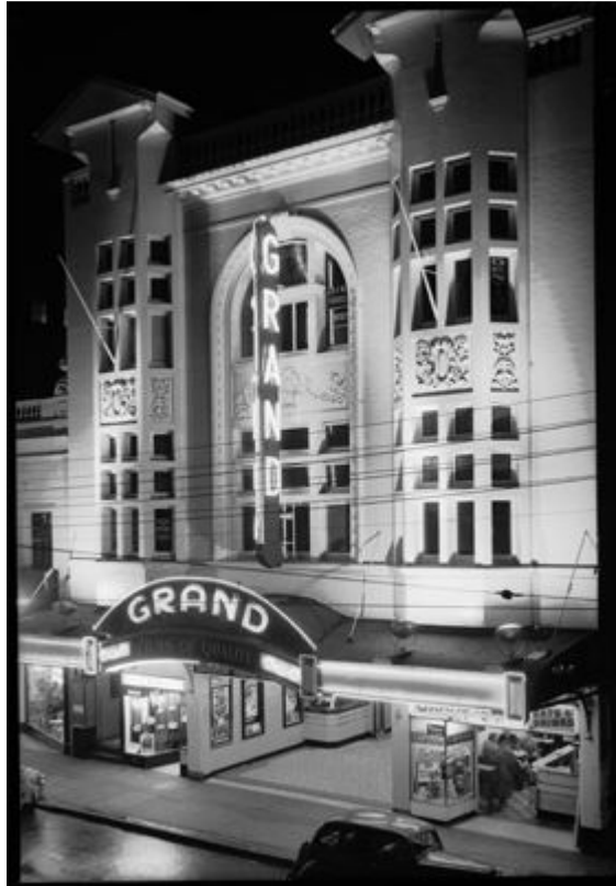
The Grand Theatre, opened in 1916 at Murray Street, Perth (SLWA 103188PD)